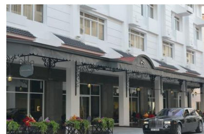
PARADISE SUITES HOTEL, HALONG BAY