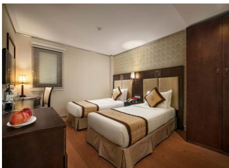
ANGEL PALACE HOTEL